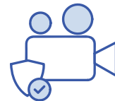
Privileged session monitoring

An enterprise-ready solution for security administrators to enable direct, granular access to critical systems spanning the entire infrastructure, and manage privileged sessions with real-time auditing controls.