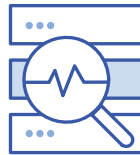
Audits and regulatory compliance