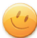
Ease of Use